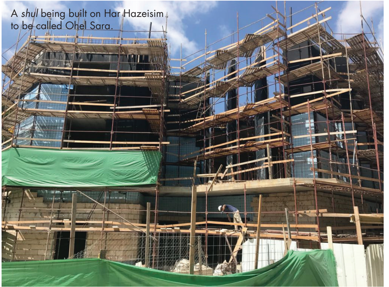
A shul being built on Har Hazeisim to be called Ohel Sara.

were born. A few more pregnancies reported. The results were unbelievable.